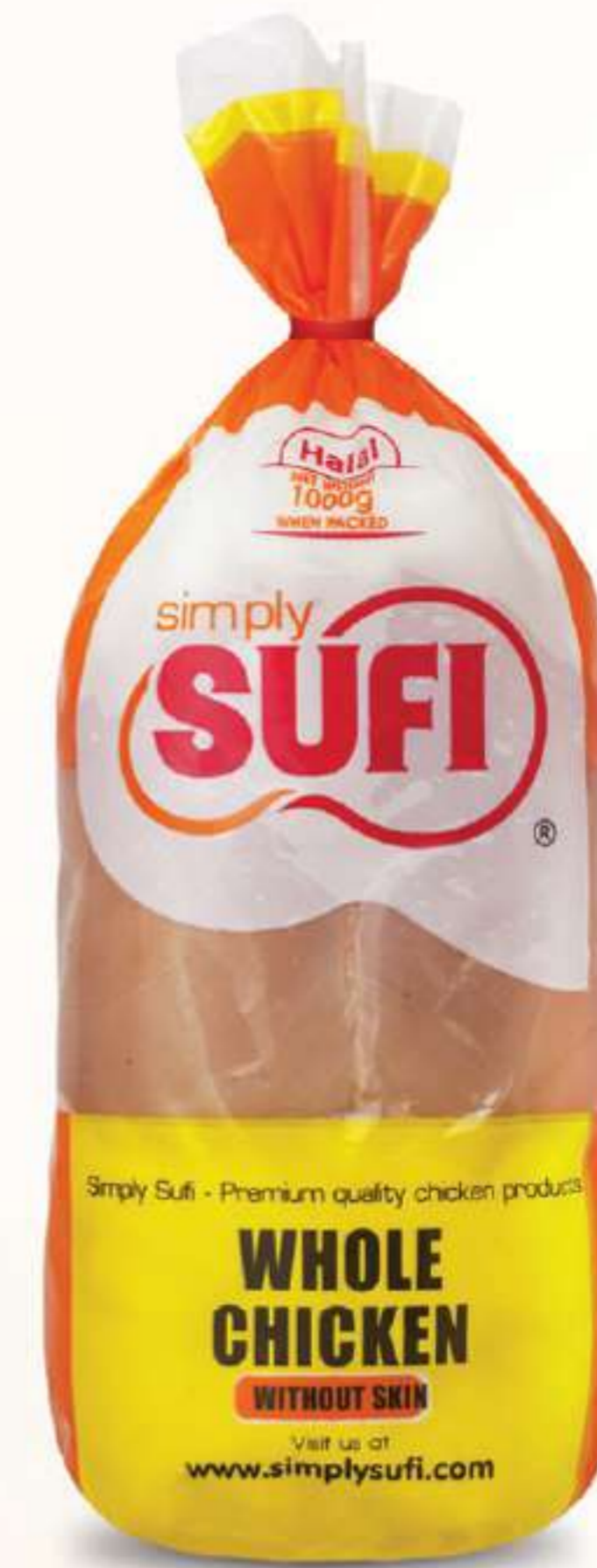
WHOLE CHICKEN WITHOUT SKIN