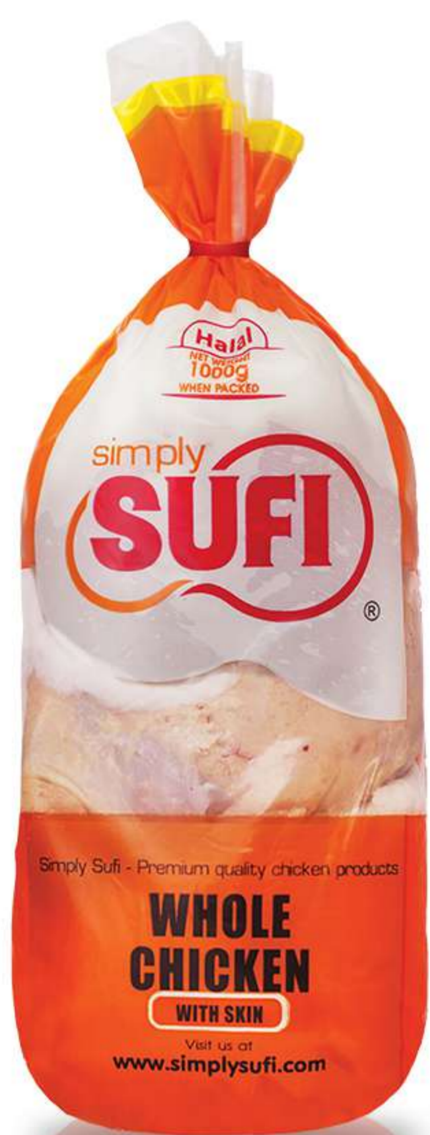
WHOLE CHICKEN WITH SKIN