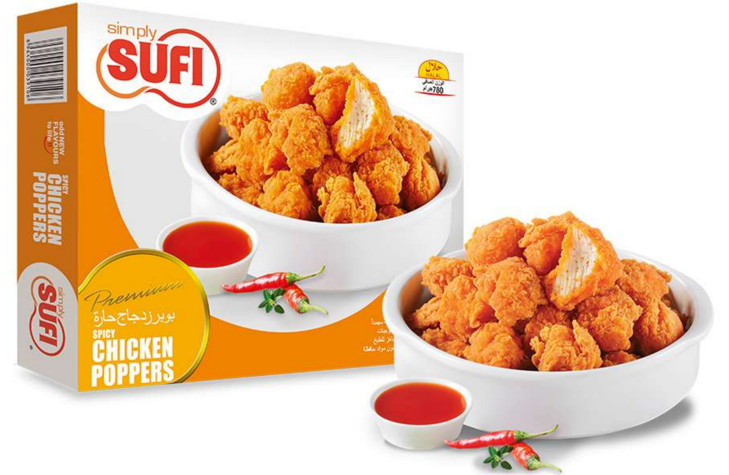
SPICY CHICKEN POPPERS