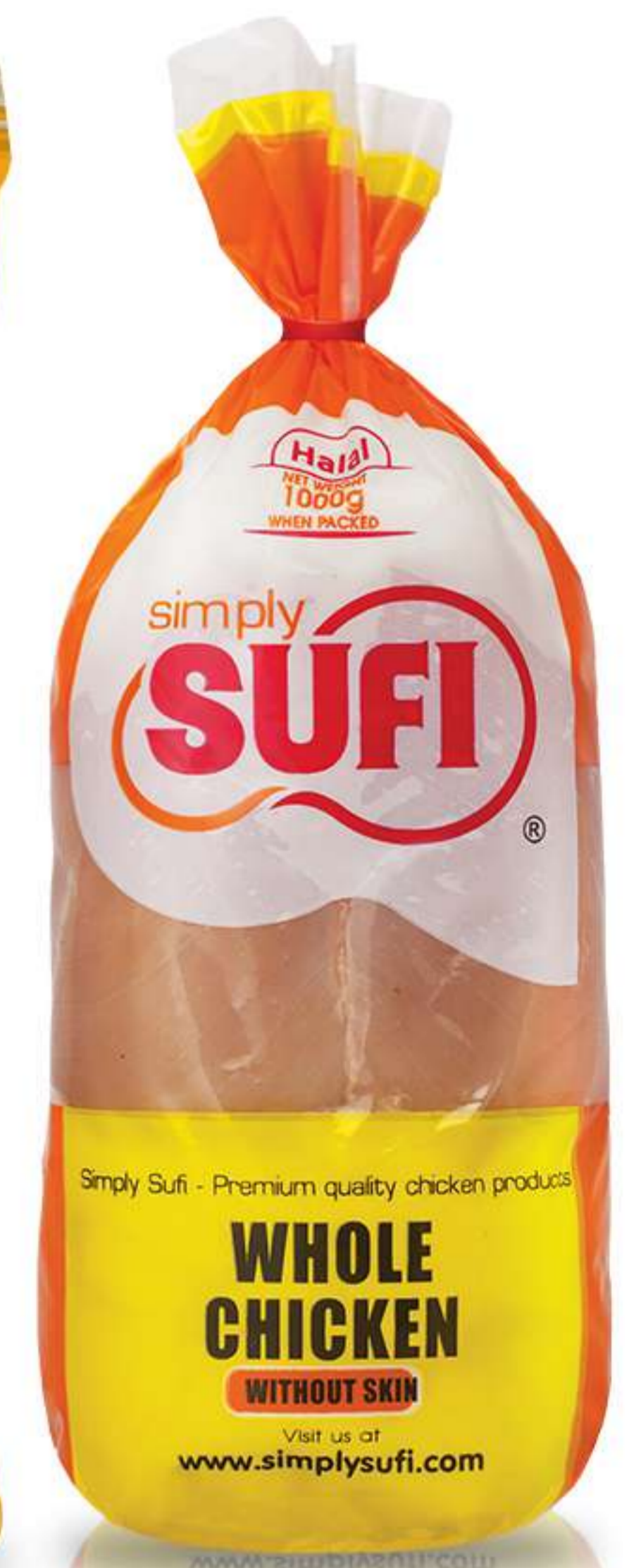
WHOLE CHICKEN WITHOUT SKIN