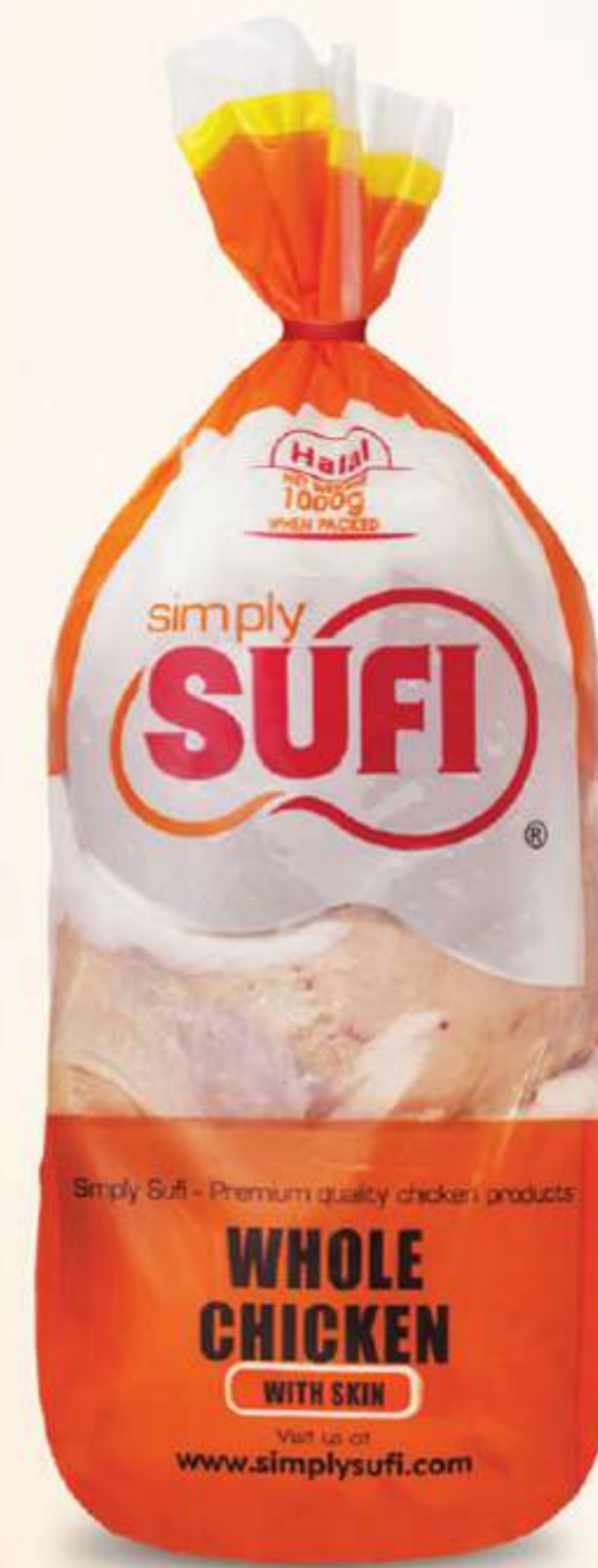
WHOLE CHICKEN WITH SKIN